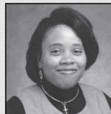
Lori Lamar Event Management