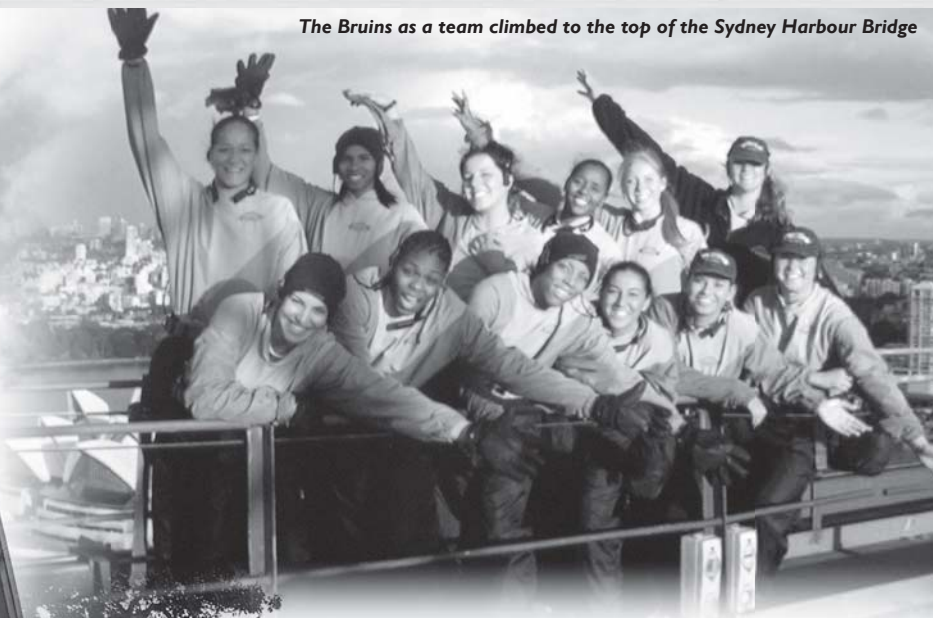
The Bruins' first stop in Australia was a scenic view of the Sydney Opera House and the Harbour Bridge.