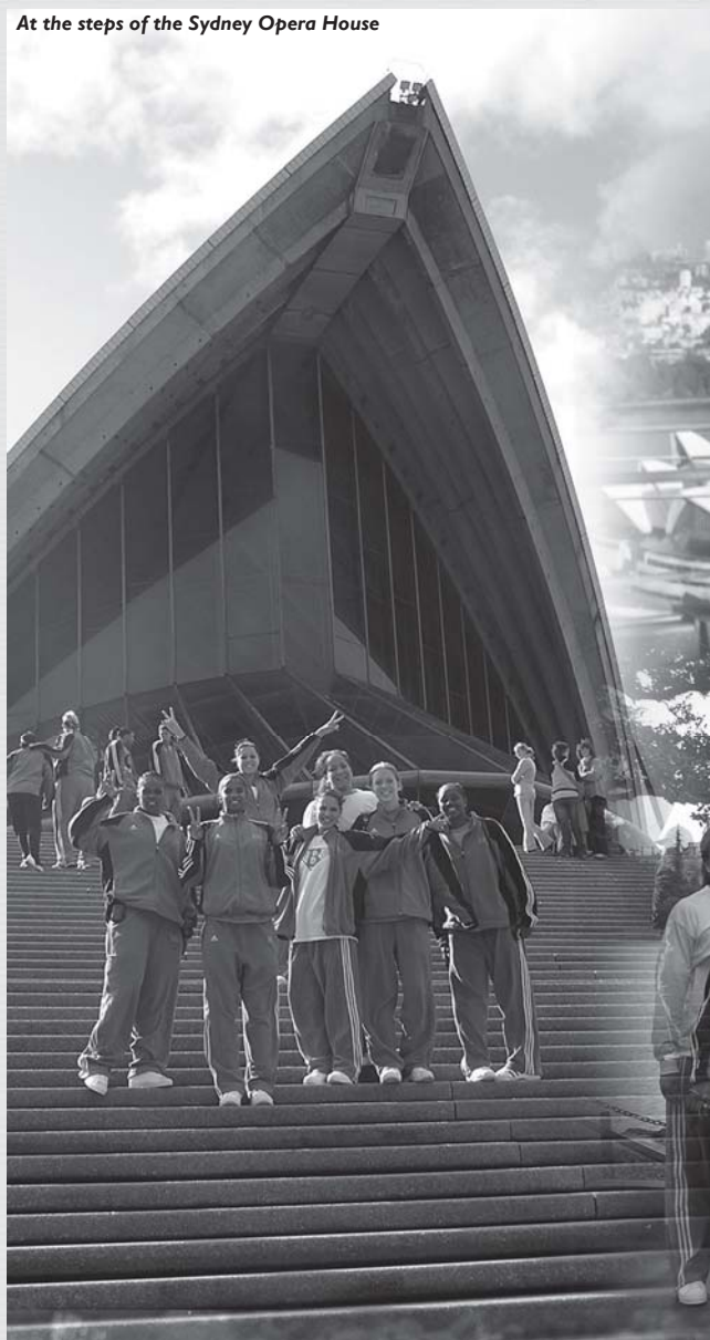
At the steps of the Sydney Opera House